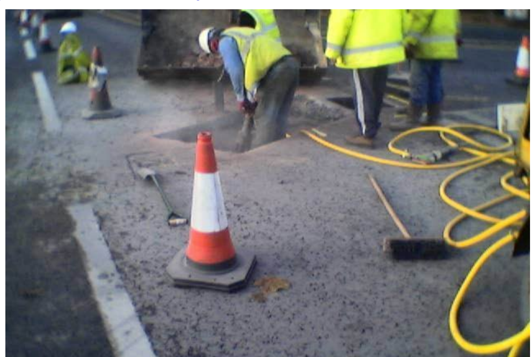
Figure 1: A Pneumatic Drill Operator

The hearing impaired will, therefore, need to be discriminated against, legally, since it would be a health and safety risk to employ someone with hearing difficulty that would most likely be aggravated by the enormous noise that the pneumatic drill emits.